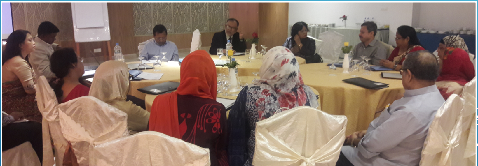
Advance Family Planning Advocacy Advisory Group

Introduction of tubal hook and uterine elevator for tubal ligation to improve quality of care