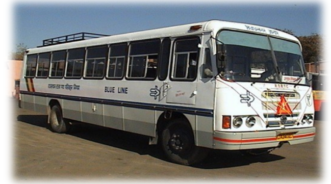
Previous situation for FP programs