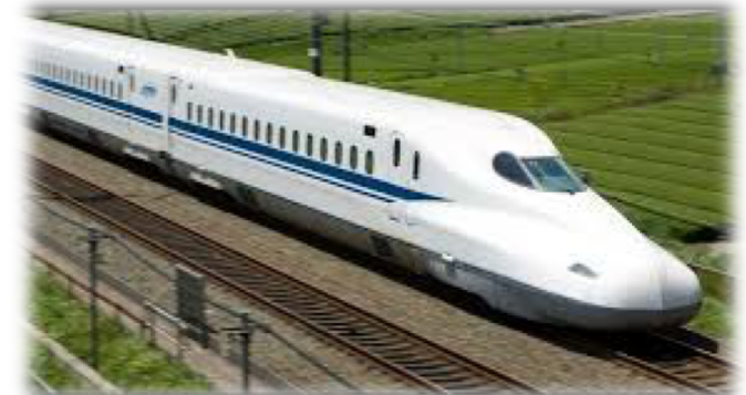
Current situation for FP programs