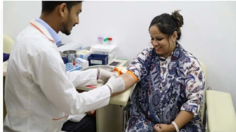
A woman sees a doctor at a facility in Bangladesh.